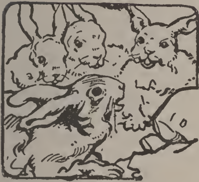
The Brown Cotton Tails Listened.

“YOU know,” said the brown cotton tail rabbit, whose name was Mr. Fuzzy Brown Cotton Tail, “I don’t like to brag or boast, but I do think our family are the most sensible and the bravest animals there are in the world.”